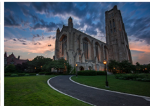
Chicago Parent Potluck