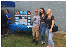
Did you see us at the Raven Rally?

Since 1995, we have been Royal Oak's international debate team. Join the ROMUN team!